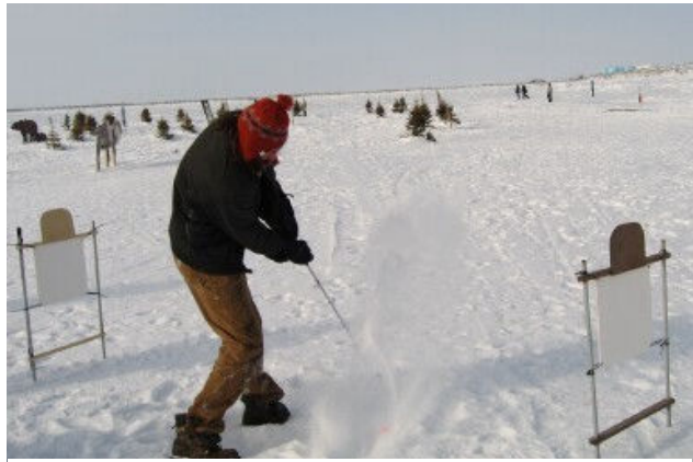
Golf on the Bering Sea

Special events today in Nome included a pancake breakfast served by the Boy Scouts and Girl Scouts of Nome, autograph session with mushers, a golf tournament and a 3 dog sled dog race. Considering my love for golf, most folks who know me would expect that I played in the golf tournament that took place out on the sea ice of the Bering Sea in the Nome National Forest. Running a dog team in Nome won out; I opted for the 3-dog race.